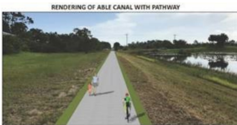
RENDERING OF ABLE CANAL WITH PATHWAY