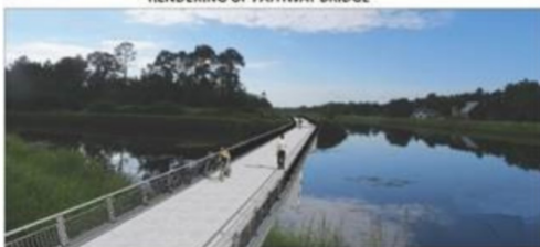
RENDERING OF PATHWAY BRIDGE